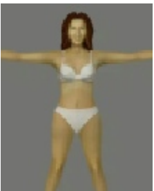
0:46-0:53 Ez-Size Project for Superscape:

-Painted in Photoshop over approx. 10-12 hours.