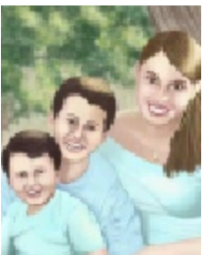
0:43-0:46 Commissioned Portrait:

-High poly character created in 3DS Max, mostly with editable splines..