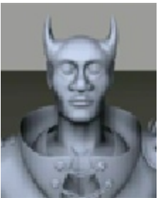
0:32-0:43 General Thaa-Kor:

-Personal piece created for portfolio from photographic reference for figure in Photoshop.