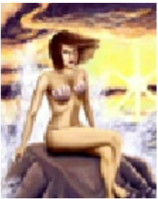
0:29-0:32 Siren of the Sea:

-Low poly character created for portfolio. Character is 8526 triangles, long dagger is 154, halberd is 172. Textures are 3, 1024 2 textures for diffuse, specular level, and normal maps. Back, chest, and left forearm were left intact to allow a swap of armor pieces. Used 3DS Max, and Photoshop w/ Nvidia normal map plug-in. Rigged with biped & physique.